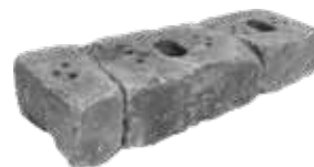
Stonegate Set of 3

6 x 4-6 x 10 | 6 x 10-12 x 10 | 6 x 14-16 x 10