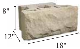
COMPAC HEWN STONE

Weight: 80# ea Face Size: 8" x 18" 1 square foot block