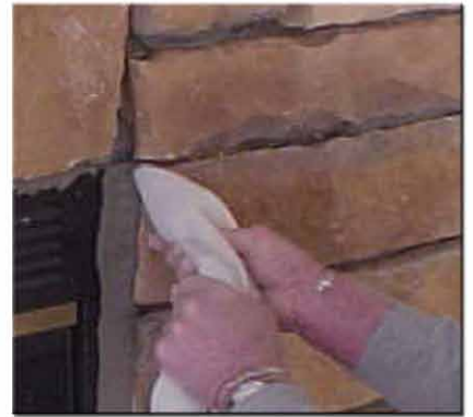
6. Grouting the joints