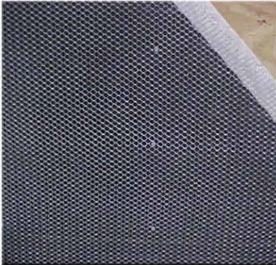
1. Prepare the Surface