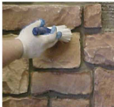
8. Brushing joints