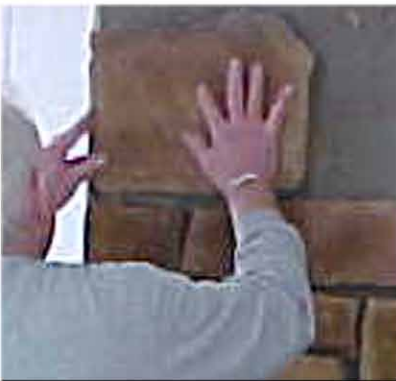
4. Applying the stone