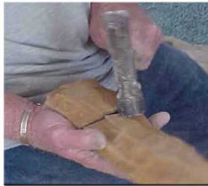
5. Trimming the stone