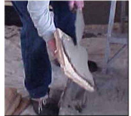
3. Mudding the stone