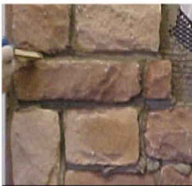
7. Striking the joints